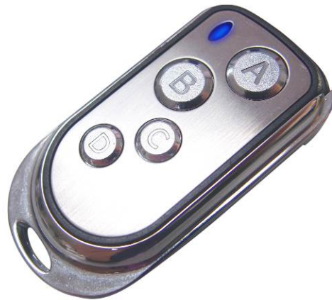
W-2 Wireless Transmitter

Wireless remote control system W-2 consists of a transmitter equipped with four buttons to turn faze output on or off, and adjust output volume; with an onboard receiver attach to the rear panel of Z-380.